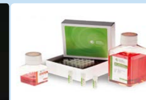
iPS cells (Cellular Dynamics International, Inc.)