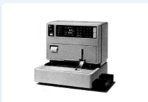
DRI-CHEM blood analysis system