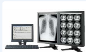
SYNAPSE medical-use picture archiving and communications systems (PACS)