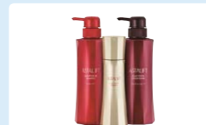
Hair care products