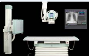
DR type X-ray imaging diagnostic system