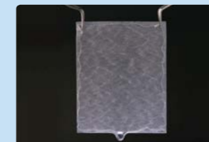
Autologous cultured epidermis (Japan Tissue Engineering Co., Ltd.)