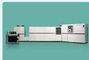
Digital X-ray imaging diagnostic system FCR