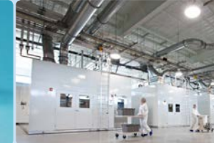
Contract manufacturing of biopharmaceuticals (FUJIFILM Diosynth Biotechnologies)