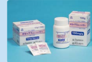
Small molecule drugs (Toyama Chemical Co., Ltd.)