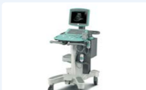
Ultrasound diagnostic equipment